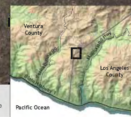
Map 2c. ESHA in 1983 and 2011: APN 700-0-170-280